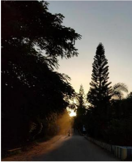
2 nd Prize Picture.