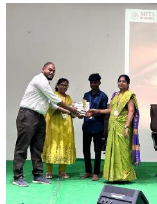
1st prize Winner