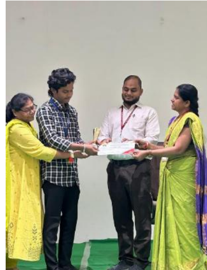
3 rd Prize Winner.