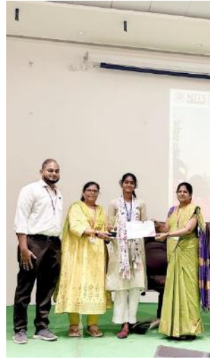
2 nd Prize Winner.