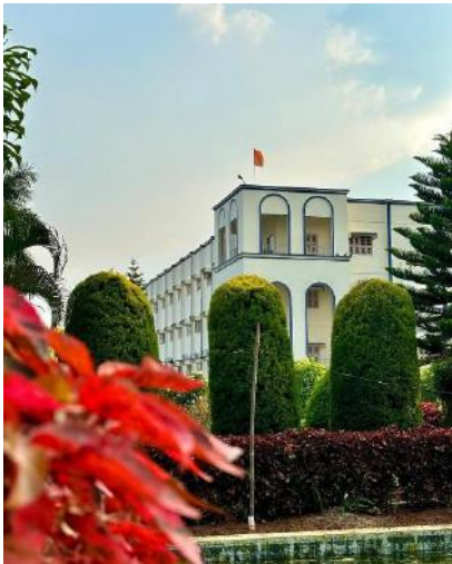
3 rd Prize Picture.